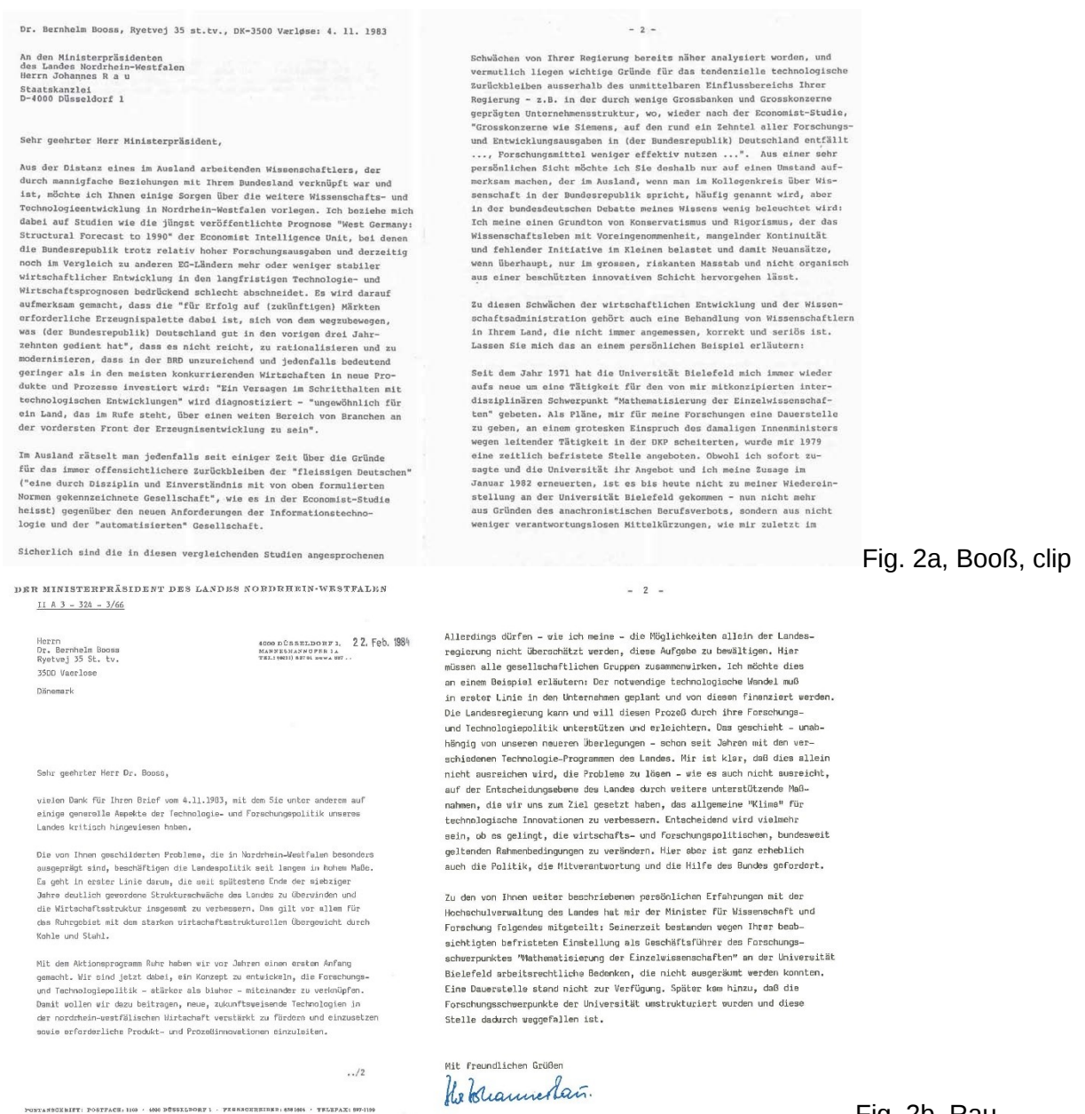
Fig. 2b, Rau

legitimate reason to exclude politically dissenting young people from public office positions. It did not matter how much the employing authority wanted them or how well-regarded they were by their superiors.